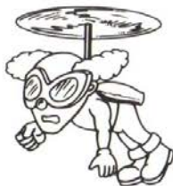
Baz the Bomber—150