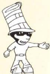
Colin the Crazy Clown—50