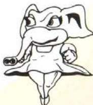
Bertha the Ballerina—200