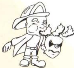
Franco the Fire Breather—200