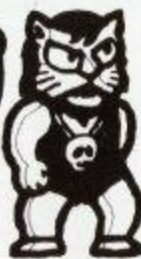
BOSS AREA 8