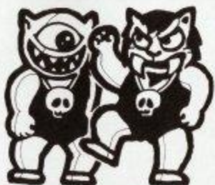
BOSS AREA 3