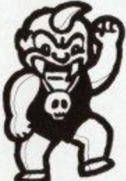
BOSS AREA 6