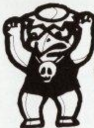
BOSS AREA 7