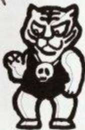
BOSS AREA 5