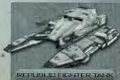
REPUBLIC FIGHTER TANK