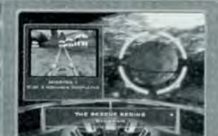
CAMPAIGN SELECTION SCREEN