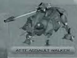
AT-TE ASSAULT WALKER