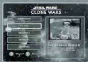
PLAYER PROFILE SCREEN

If you haven't previously played Star Wars: The Clone Wars , you will need to create a player profile to save your game. The game will default to Nintendo GameCube™ Memory Card slot A. If no Memory Card is detected, the game will search Nintendo GameCube™ Memory Card slot B. The game will establish a save file in whichever location you have your Memory Card inserted to update your