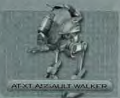
AT-XT ASSAULT WALKER