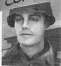
Cpl. Sam Corrión

Sam, 26 years old, feels the weight of responsibility for his men heavily. He fears that any slip could cost the lives of the men around him and believes that he should have got the promotion to 2nd squad over Hartssock.