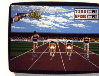
Atari® ST™ version

You've trained hard for this moment. Now get ready for record-setting excitement as you compete in five events that test your skill and experience. En Garde: suddenly there's a new point to Fencing. Stretch to the limit as you vault the Hurdles. Hit your mark in the High Dive. Push yourself that extra inch in the Triple Jump. Then take aim and shoot for the gold in Skeet Shooting. If you've got what it takes, you'll wear gold this summer.