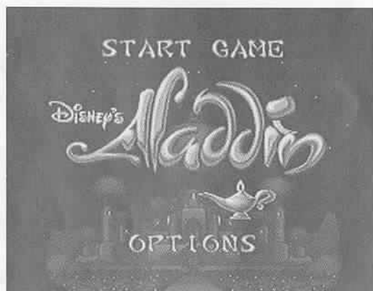
The Title Screen