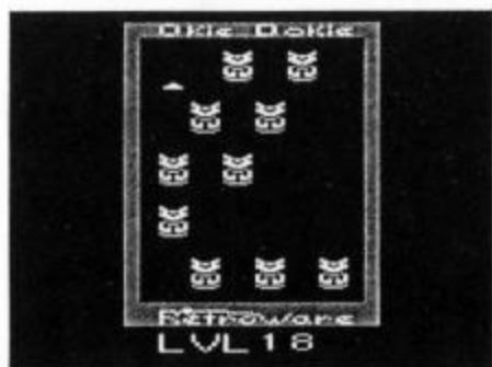
Figure 1 - The Okie Dokie Game Screen