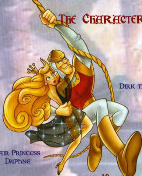
DIRK THE DARING