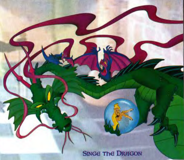
SINGE THE DRAGON